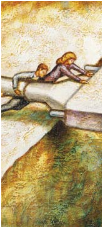
Figure 2. Typical Academy Student

For the remainder of the semester, students move as a cohort through a series of classes we call the Bridge Semester. These classes include college-level courses in computer algorithms, career awareness, two digital management, movement education, English and Learning to Learn (which was previously a separate class but is now integrated into other classes). We use an integrated curriculum and behavioral approach and emphasize experiential education and student participation. In one of the digital management courses, students do much of their work in self-managing work teams, a management technique based on creating the conditions for cooperative teamwork drawing on the strengths of each team member. It is used widely in high-tech companies and other knowledge-work settings. This particular mix of 16 units gets students